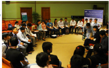
Youth at roundtable discussion during conference

We are inspired by the benefits of joining OGP by 64 countries in the world such as boosting their economic, building trust between the government and its constituencies, harnessing good governance and enhancing integrity of government and country, increasing ownership and participation from citizen in development process and results, and many more.