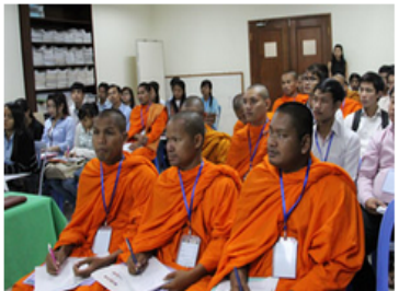
Group of Access to Information during break-out room

We also call civil society organizations in Cambodia to