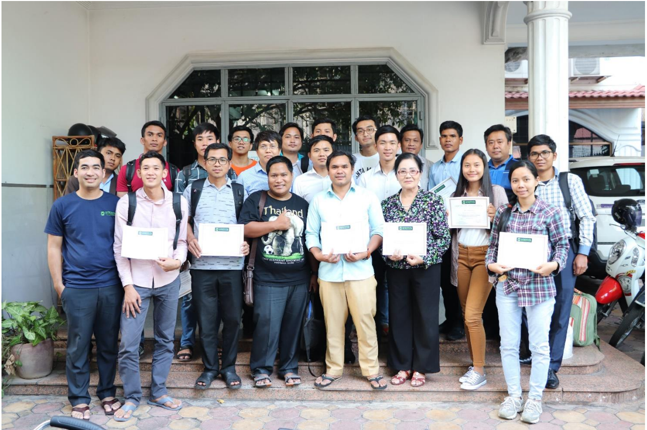
Participants are having group photo after receiving the certificate of completion.