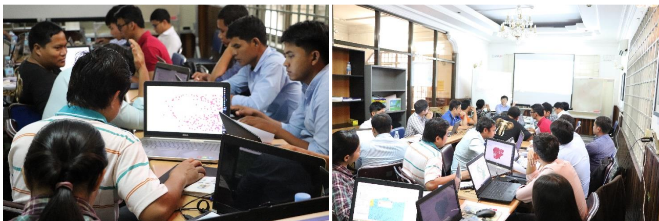
Activities in Fundamental of QGIS

1 st Workshop: Fundamental of QGIS (March 12-14, 2018)